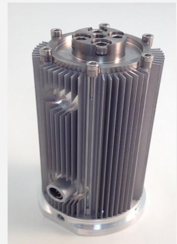
Encapsulated Pre-stressed Piezoelectric Actuator (PPA-E) Cedrat Technologies SA